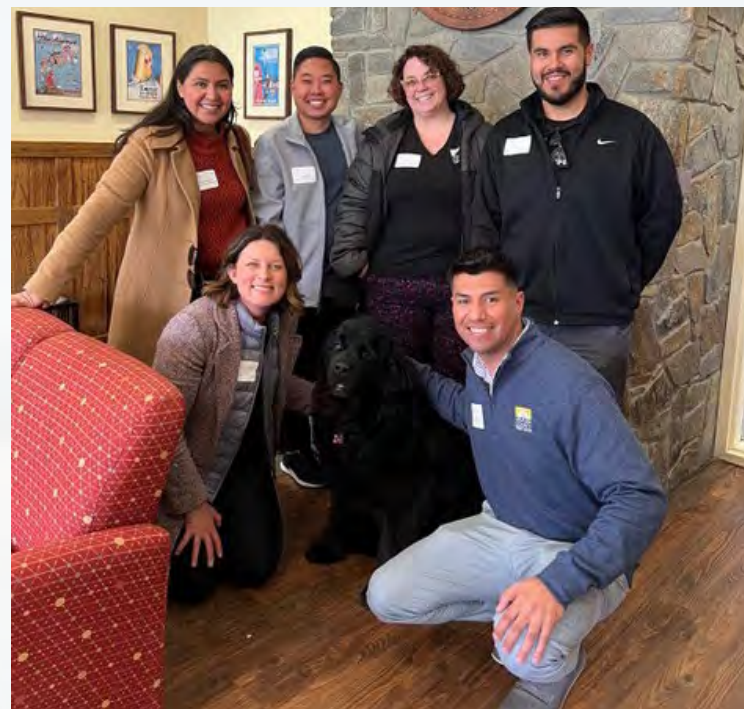
Members of our Give Back Committee and Community Development team had the opportunity to tour Casa Pacifica to plan volunteer activities, financial literacy events, and foundation grants for 2023.

Unaudited financial statement. Fiscal year ends June 30.